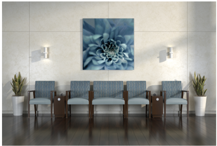
Model: VLDFIXG11 24W 27D 35H 20SW 19SD 19SH 26AH

The Valdina Short Back – Fixed is thoughtfully designed, featuring clean lines, a spacious removable seat and an angled fully upholstered back. The chair back extends to the seat rail and the cleanout is incorporated behind the seat cushion providing a clean, functional look. This is exactly the type of comfortable seating required in a reception area, lobby or waiting room. Optional center linking tables and corner linking tables with a leg support may be added to the Valdina Fixed chairs.